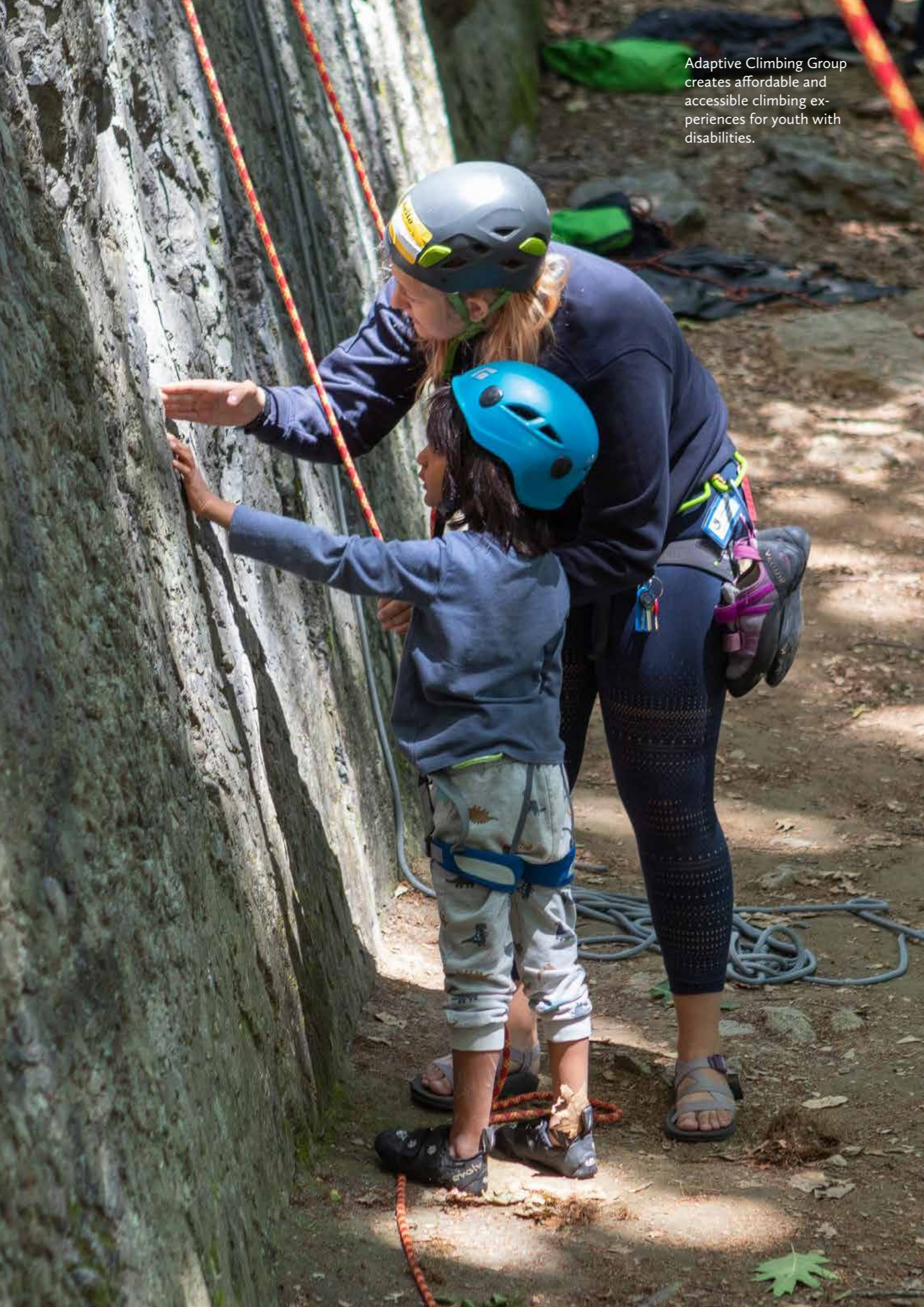
Adaptive Climbing Group creates affordable and accessible climbing experiences for youth with disabilities.