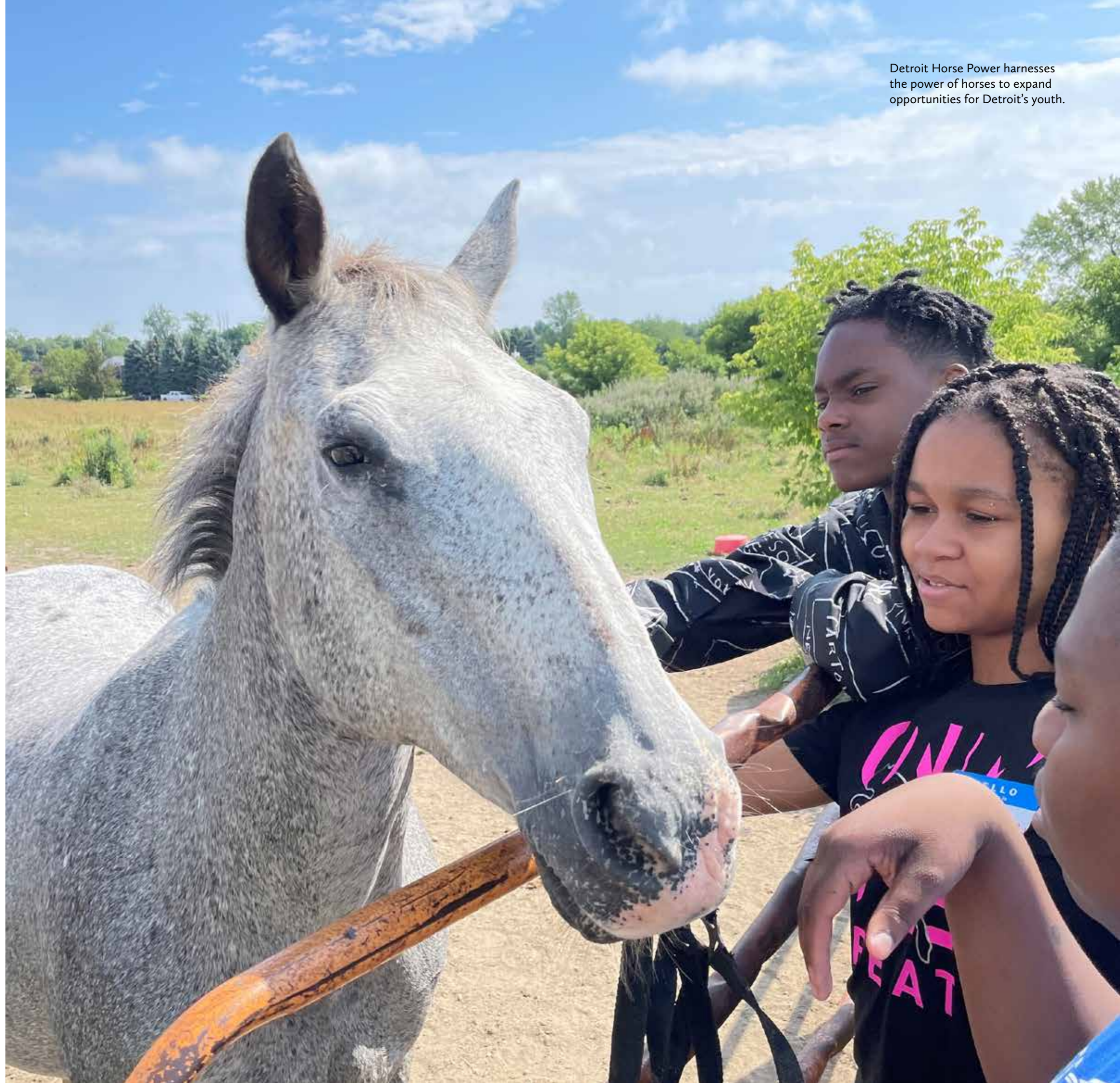
Detroit Horse Power harnesses the power of horses to expand opportunities for Detroit's youth.

Blackpackers Environmental Grantmakers Association/Blue Sky Funders Forum Forefront Los Padres Forest Watch Muddy Sneakers Native Americans in Philanthropy Partners for Environmental Justice Sitka Trail Works Young Masterminds Initiative